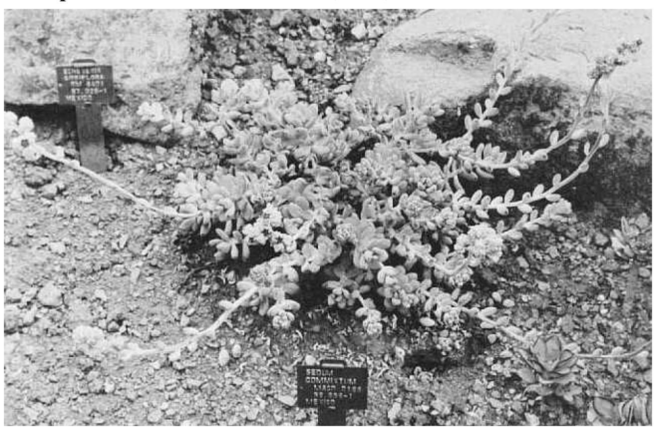
Fig. 1. Sedum commixtum at the U.C. Botanical Garden, 1961. PCH photo.

First publication in CSJA Vol.52, N°4, 1980.