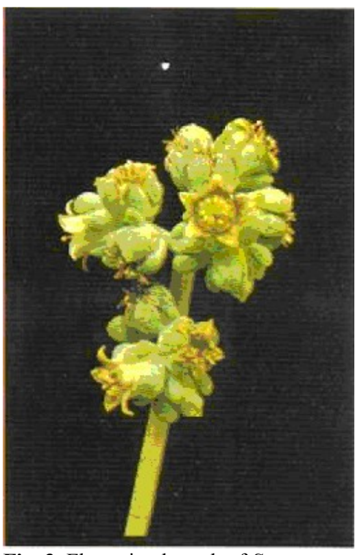
Fig. 3 . Flowering branch of S. commixtum , at U. C. Botanical Garden, 18 June 1964. x 1.8.

with sides slightly channeled, the limb 7-8 mm wide, the segments in bud imbricate, in anthesis gently outcurved with tip slightly recurved, ovate, acute with blunt subdorsal mucro, 3 mm long, 2.5 mm wide, thickened in lower half on either side of filament and thicker than wall of tube, irregularly marked with dark red, especially near margins but also across middle. Stamens 10, the filaments reddish above, the antesepalous ca. 5 mm long from corolla base, adnate 3 mm but standing out conspicuously below, the free part ± subulate, ca. 2 mm long and 0.5 mm wide, the epipetalous adnate ca. 4 mm and not discernable below, the free part (filament proper) ca. 1 mm long and 0.6 mm wide, ± triangular, flattened and lying in channel of corolla segment; anthers exserted, dull yellow flecked with red, oblong, 1.2 mm long, 0.55 mm wide; antesepalous slightly higher than epipetalous. Nectar glands yellowish, truncate, ca. 1.4 mm wide, 0.3 mm high, 0.2 mm